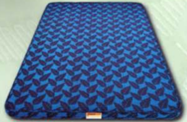
DOSTH MATTRESS An economy model that offers true value-for-money. Available in 2 inch and 3 inch thickness.

Rubco rubberised coir mattresses are available in seven variants, each catering to a specific user segment. The range comprises of everything from regular mattresses to special orthopaedic models and high-end luxury varieties. They come in varying sizes and thickness, depending on the specific use they are meant for. The VFO technology is a feature common to all the models.