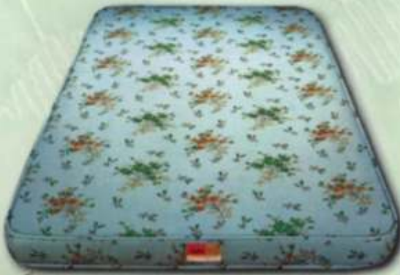
Safal MATTRESS A regular mattress that combines comfort and durability. Available in 3 inch and 4 inch thickness.