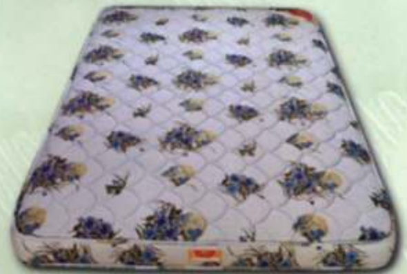
HEAVEN MATTRESS A premium model that provides unmatched sleeping comfort. Available in 3 inch and 4 inch thickness.