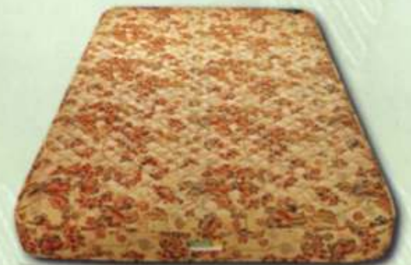
Relief ORTHOPAEDIC MATTRESS A special mattress scientifically designed for orthopaedic patients. Available in 5 inch thickness.

Dimensions/thickness can be customized for large quantities.