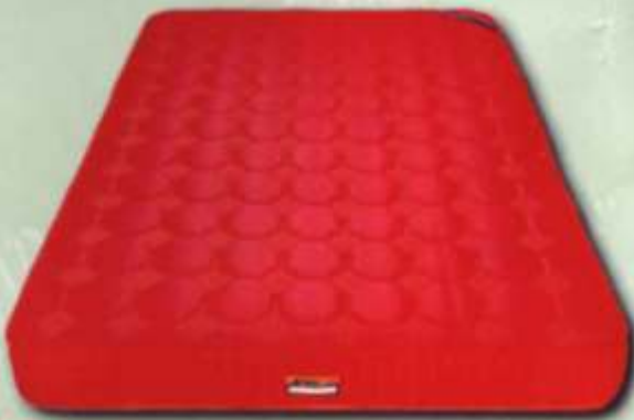
Hi-Tech MATTRESS A high-end model with an accent on finish and luxury. Available in 5 inch thickness.